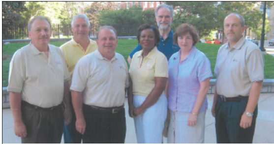
Erie County's first class of Six Sigma trainees used their knowledge of quality improvement and Minitab Statistical Software to save taxpayers more than $2 million in 2008.